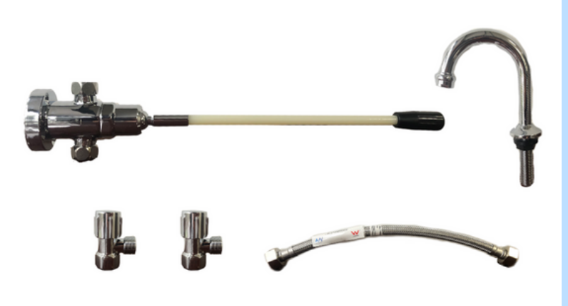
49010- Knee Valve Auto Tap Kit